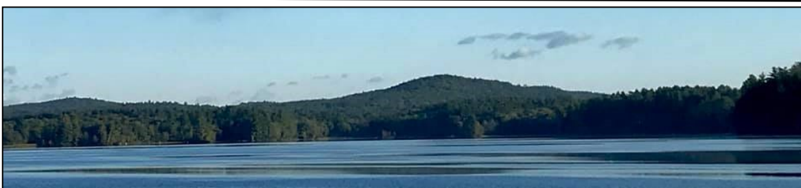
View across Pocasset Lake, Margot Gyorgy